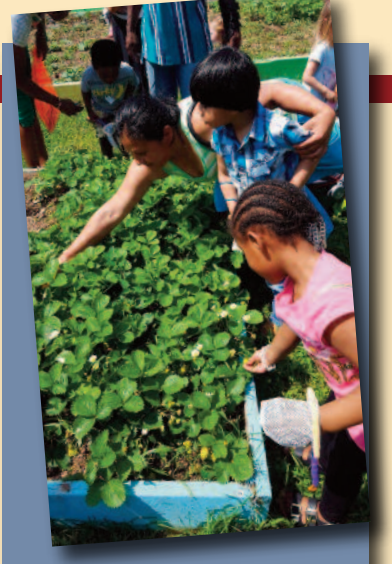
Children in the Lincoln Little Learners Playgroup learn about gardening.