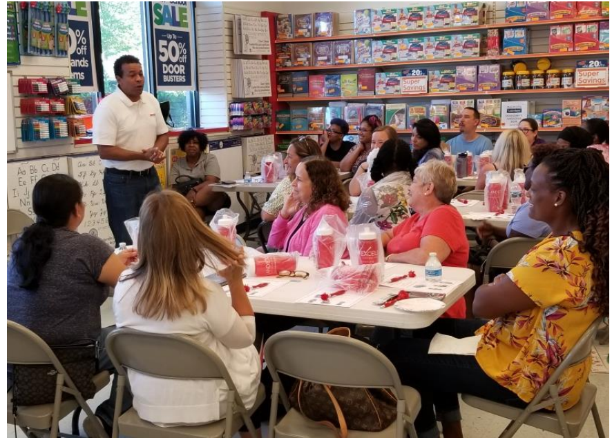
Maryland EXCELS inclusive practices training at Lakeshore Learning in Towson.